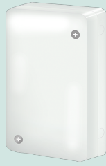
CZ-CAPRA1 RAC interface adapter for integration into P Link