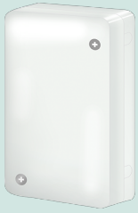
CZ-CAPRA1 - P-Link-Adapter für die Einbindung von Raumklimageräten in die P-Link-Kommunikation