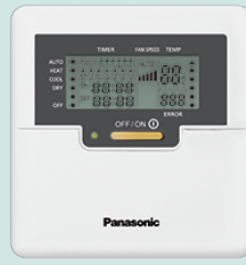
Wired Remote Control CZ-RD514C